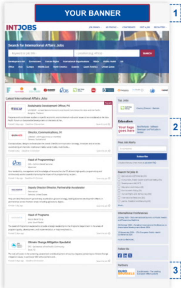
1. Leader board Banner / 2. Education and Courses/MBA Box 3. Partner Profiles